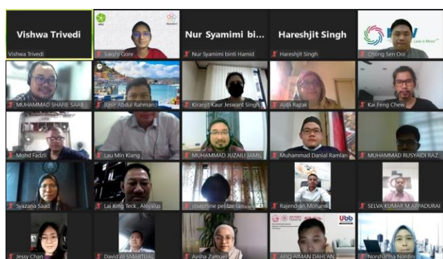
Snapshot of Masterclass – Batch 2

Ekonnnect partnered with the Malaysian Green Technology and Climate Change Centre (MGTC) and Green Growth Solutions Asia (GGSA) and has successfully completed 2 week-long Masterclasses for educating Malaysian SMEs on concepts related to Circular Economy to help build resilient businesses in a post-pandemic era. Participants were taught by experts in the field of Circular Economy, Life Cycle Thinking, Business Models, and Policymaking in Malaysia. The first and second batch of this Masterclass was conducted between 29 th November to 4 th December, and 6 th to 11 th December respectively. More than 175+ small businesses from Malaysia participated in these events. Participant gave an overall rating of 8/10 to this program.