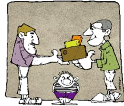
January 2021 Theme - Minimalism

We are pleased to bring to you, a very special 'New Year' edition of EMC Ekonnnect monthly e-newsletter. As promised in the previous issue, we have some very special announcements and updates to share with you. For more information or feedback, please contact us at emcblogs@emcentre.com